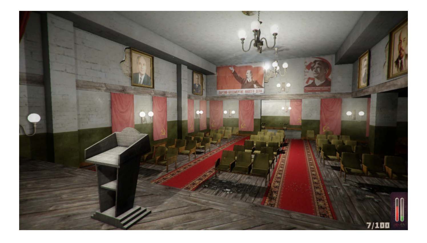
An Alien With A Magnet Torrent Download [full Version]

Download ->>> <a href="http://bit.ly/2JZT6ZT">http://bit.ly/2JZT6ZT</a>