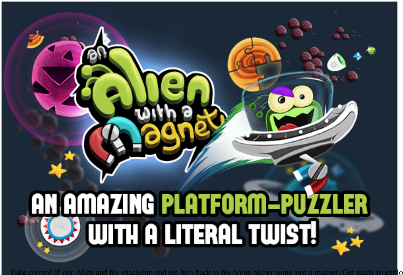
multiple galaxies using this magnet to orbit around colourful and unique planets to get to your goal. But beware of dark holes, challenging puzzles, multiple locks and asteroids blocking your path in space!

Besides the adventure mode, you can also play an extra bonus mode which will keep you busy for even more hours of fun gameplay! Beat your friends in the online leaderboards with Time Attack and prove to them once and for all you are faster than they are!